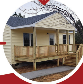
Progress showing Appomattox County Tornado Recovery CDBG Home Rebuild