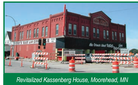
Revitalized Kassenberg House, Moorehead, MN